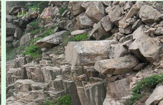
The "Cannon Rock"